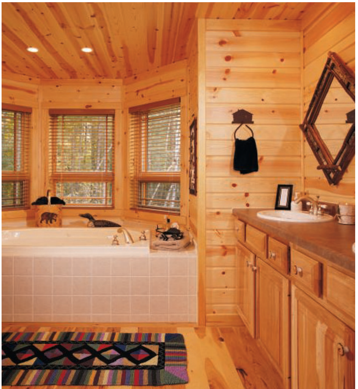
ABOVE: The master bath has a “bump out” for the tub. LEFT: The master bedroom enjoys plenty of natural light, much of it coming through glass doors and a semicircular window overhead.

LOG HOME MANUFACTURER AND BUILDER: Tomahawk Log & Country Homes, Inc., Tomahawk, Wisconsin.