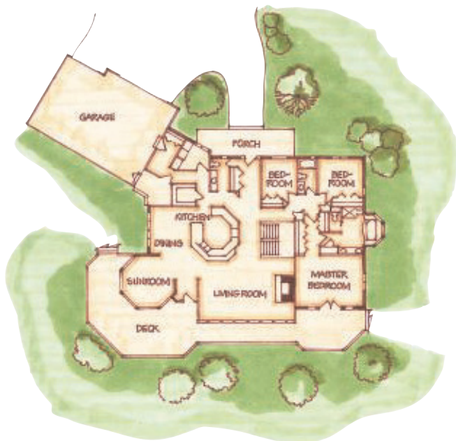
ABOVE: Waiting beside the front door, a carved black bear holding a fishing pole welcomes guests. LEFT: Rooms flow one to the other from the great room to the sun porch. The four stools, providing optimal seating at the kitchen bar, were made by Living Cedar.